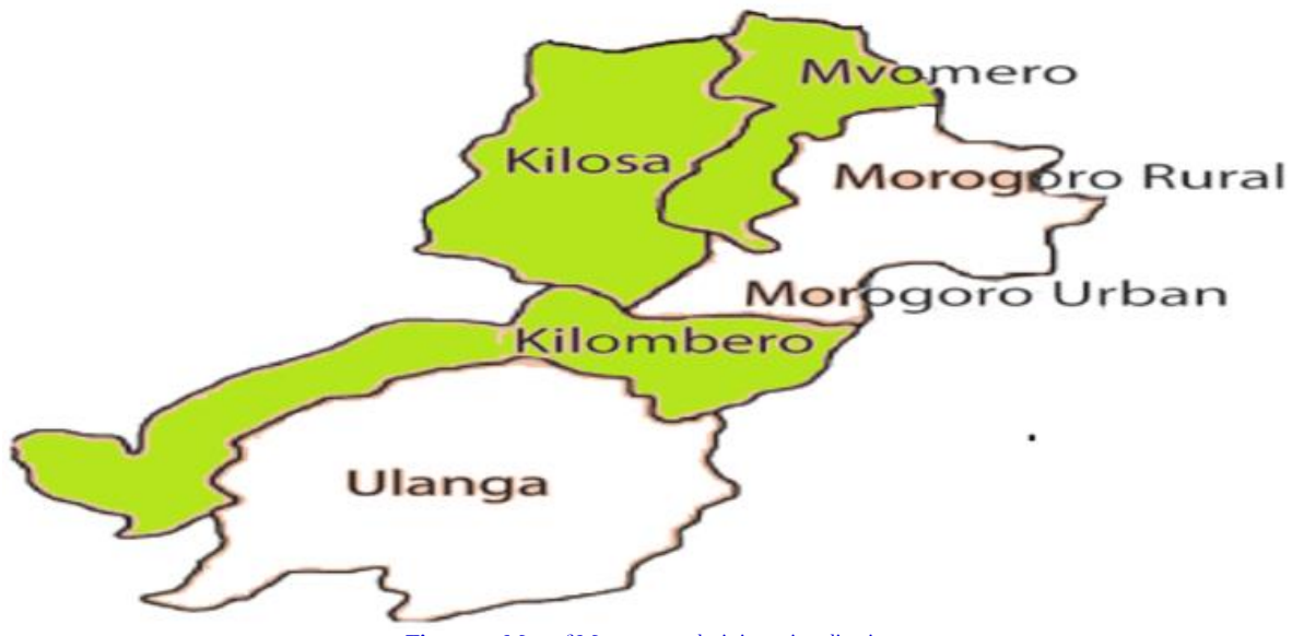
Figure 1. Map of Morogoro administrative district.

Morogoro region is one among 31 regions in Tanzania. It is located between 5^{0.}58 " to 10^{0} 0" Latitudes South of the Equator and 35^{0.}25 " to 35^{0.}30 " to the East. It has seven neighbours' regions namely; the north border by Tanga and Arusha Coastal region in the East, Dodoma and Iringa west and Ruvuma and Lindi to the South. The region has a total land area of 70624, which is 8.2 percent of the total area of Tanzania. The region ranked 2nd out of 31 regions with the largest land areas in Tanzania below the Tabora region with land reaching 76150 square kilometres (Tanzania in Figure 1).