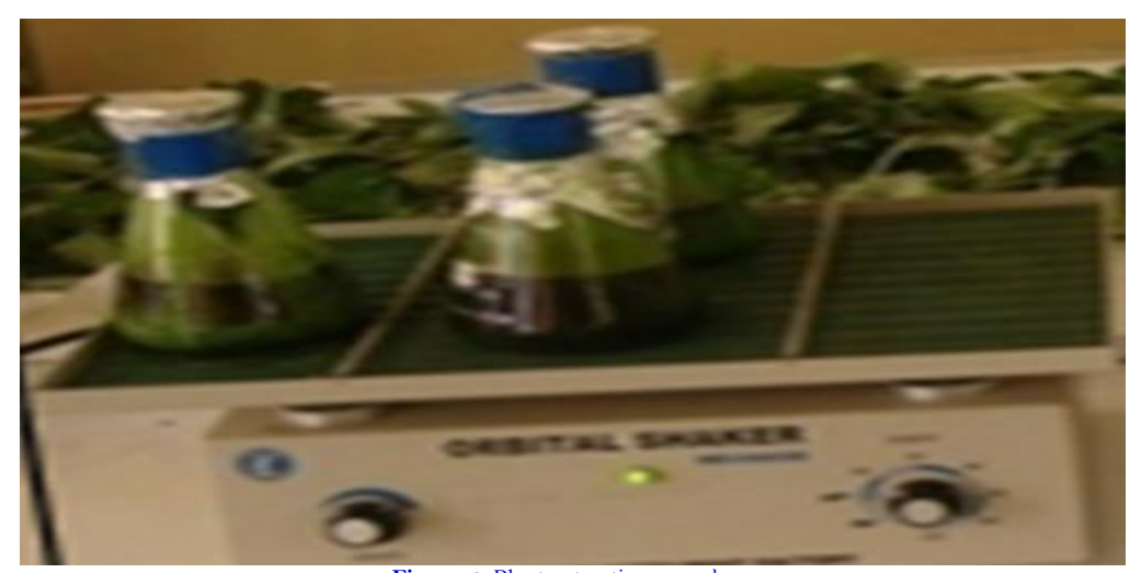
Figure-2. Plant extraction procedure.

The International Journal of Biotechnology, 2019, 8(1): 75-83