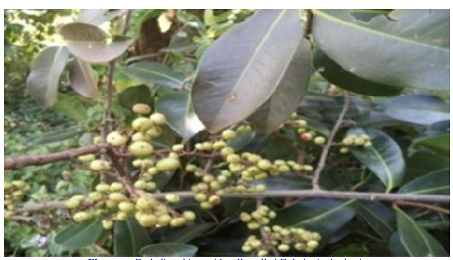
Figure-1. Embelia schimperi locally called Enkoko in Amharic