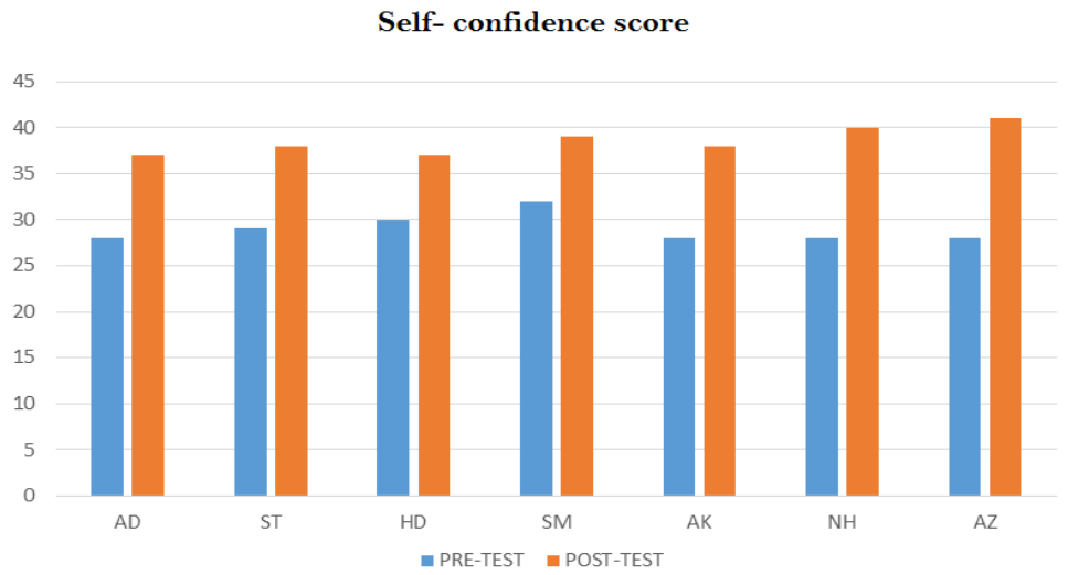
Figure-3. Pre-test and post-test scores on self- confidence.

The higher improvement on this aspect was also a proof of the effectiveness of role playing on students' motivation. After paired-samples t-test calculation, the data above showed that the t-obtained is 9.933 where means is greater in the t-table 2.447 (df=6). It suggests that there is a significant difference between students' learning motivation before and after using educational games of role playing as learning media. The research also suggests that role playing can effectively motivate students with disability in performing their roles on the stage.