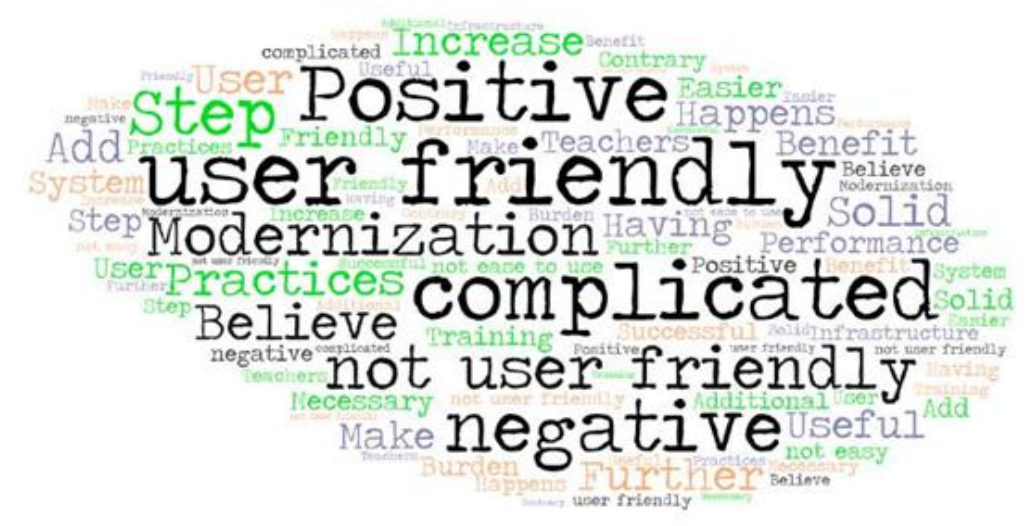
Figure-2. Tag cloud metadata description.

A tag cloud visually represents text data, depicting keyword metadata from free-form text, according to the frequency, significance, and category of words expressed in the interviews. This method was therefore used to highlight important findings from the interviews, and helped address the problems found during the research. The tag cloud was arranged in line with the visual taxonomy based on a number of attributes, such as context, shape, and alignment, depending on a word's level of importance. The tag cloud was developed using WordArt to control the aesthetics and construct a two-dimensional layout. Figure 2 represents the results of the tag cloud methodology.