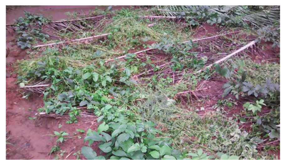
Figure-1. The Telfairia occidentalis Plots