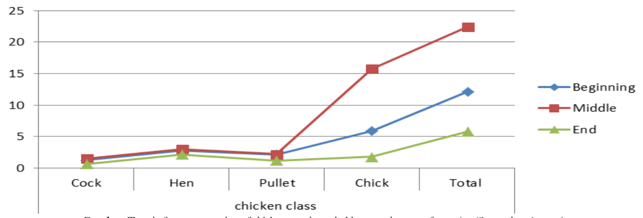
Graph-1. Trend of average number of chickens per household across the year of 2012/13 (September-August) Comparatively, the average number of chickens at the beginning of the year was higher than that of the end of the year. This implies that the numbers of chickens declined and its contribution for the next year chicken flock building becomes less. At the same time, it is signal to take some corrective measures to reverse the trend.

In the beginning and the middle of the year, the average number of cock, hen and pullet had similar value which ranged from one to four chickens, whereas the mean value of chicks in the middle of the year (15.76) was higher than the average number at the beginning (5.85) and end (1.79) of the year. Finally, at the end of the year the average numbers of all types of chicken dropped into just about between one and two. In all three seasons, fluctuation of the average number of cock, hen and pullet was small throughout the year, whereas the mean difference of chicks was highly fluctuating across the seasons of the year. In the beginning, middle and end of the year, the overall mean number of chicken kept per household were 12.07, 22.4 and 5.79, respectively.