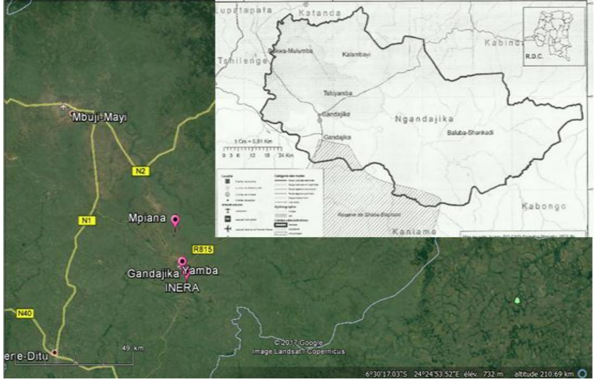
Figure-1. Map of Lomami province showing study locations (Ngandajika, Mpiana, Yamaba sites).

technologies that may be disseminated by researchers and extension services. Farmers from these areas are likely impacting positively on other farmers from the surrounding since they are quick adopters of new information delivered by extension services.