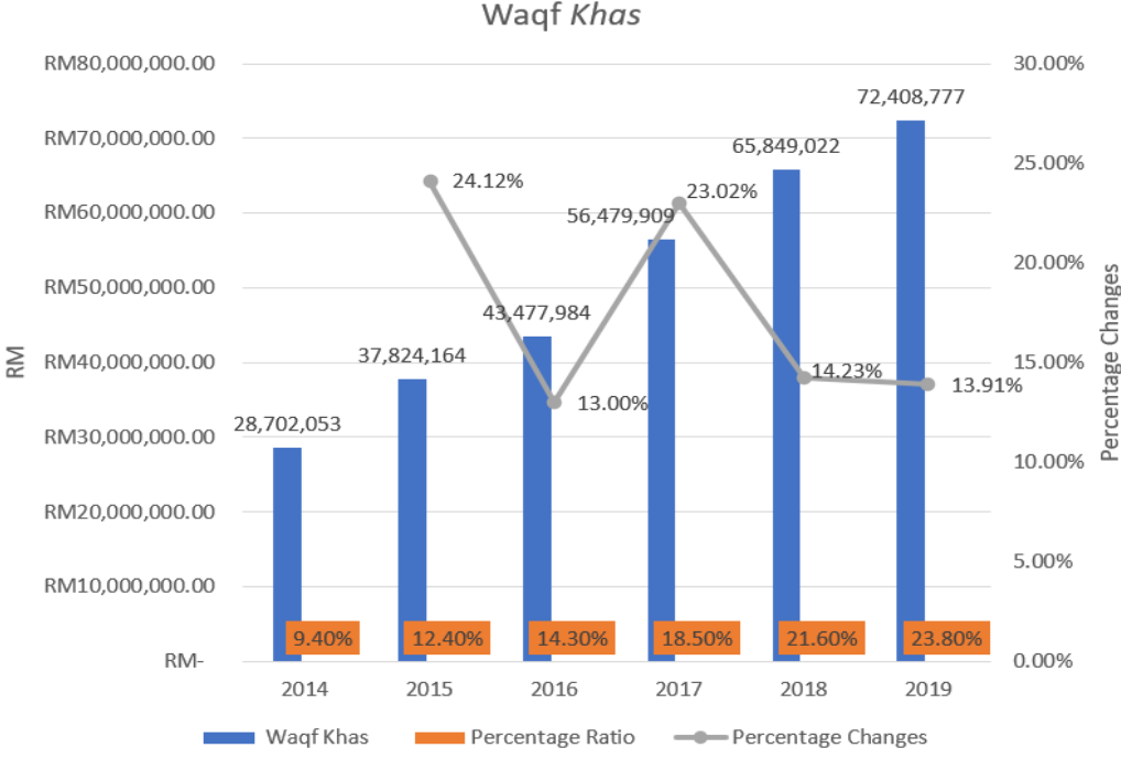
Figure 2. Changes in PWS waqf khas income.

In terms of waqf khas , the percentage change increased drastically in 2015, reaching 24.12 percent, but decreased by 13 percent in 2016. However, the percentage change increased by 23.02 percent in 2017, but decreased by 14.23 percent in 2018. Furthermore, in 2019, the percentage change decreased to 13.91 percent.