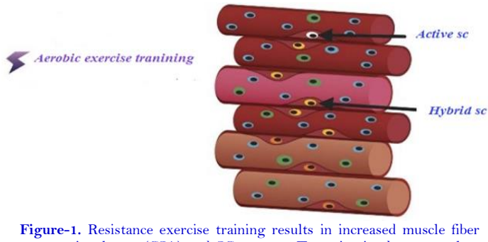
rigure-1. Resistance exercise training results in increased muscle fiber crosssectional area (CSA) and SC content. To maintain the myonuclear domain, it is believed that SCs fuse to growing muscle fibers, "donating" their nuclei to support this growth [1].

The effect of resistance exercise and aerobic exercise training on the SC pool in human skeletal muscle is described in Figure 1. Our review discusses advances regarding the influence of aerobic exercise training on SC function.