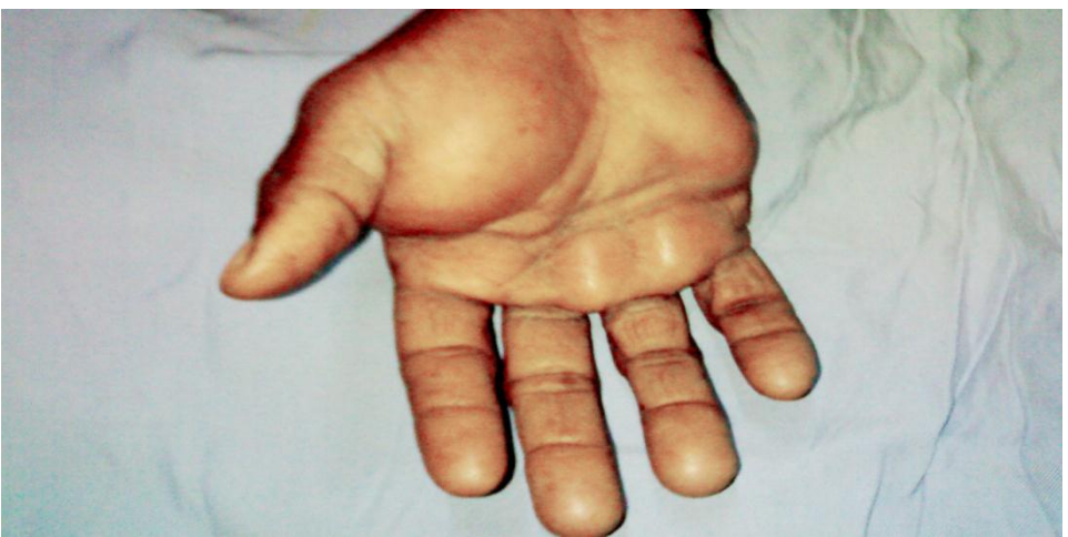
Fig-1. Lipomatosis Hand swelling