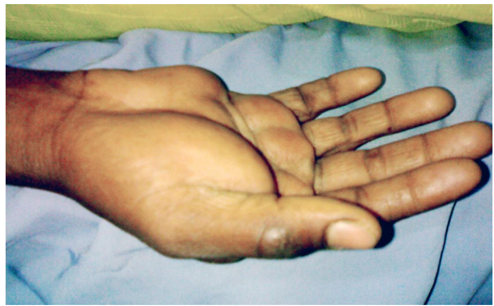
Fig-2. Lipomatosis Hand swelling, Thenar and hypothenar prominant swellings