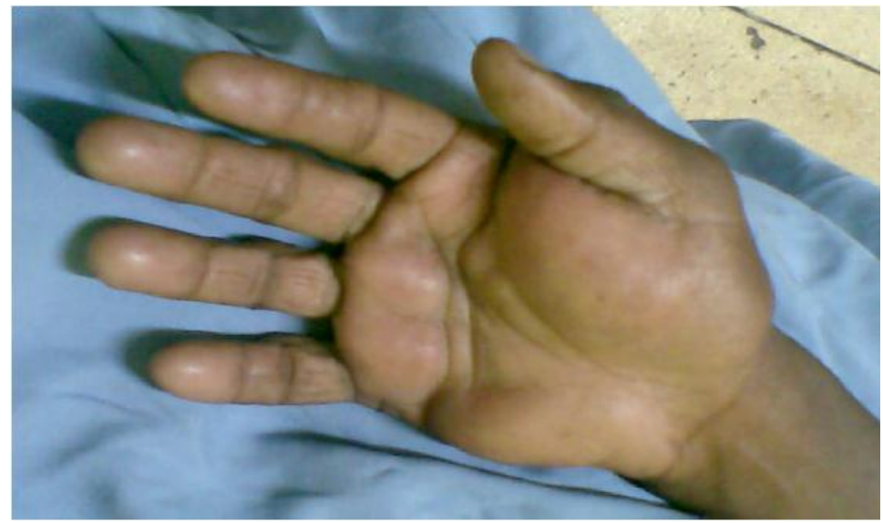
Fig-3. Lipomatosis Hand swelling at thenar, hypothenar and bases of fingers