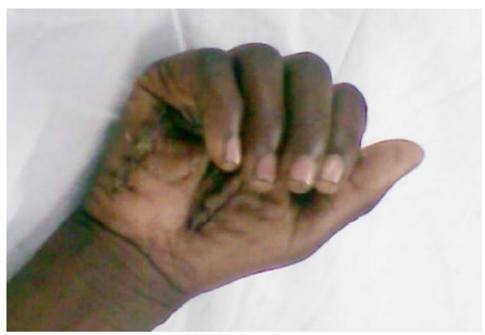
Fig-10. Postoperative no residual deformity

Views and opinions expressed in this article are the views and opinions of the author(s), Journal of Diagnostics shall not be responsible or answerable for any loss, damage or liability etc. caused in relation to/arising out of the use of the content.