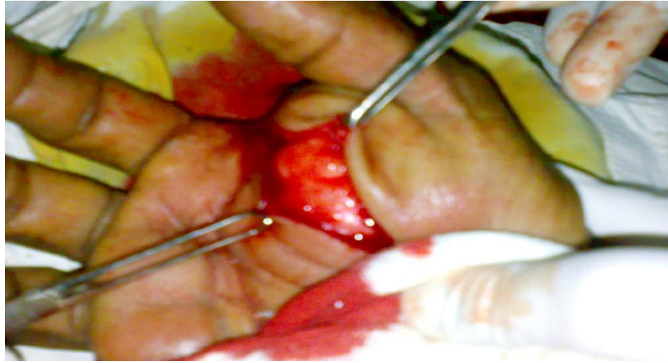
Fig-4. Incision at Thenar Swelling