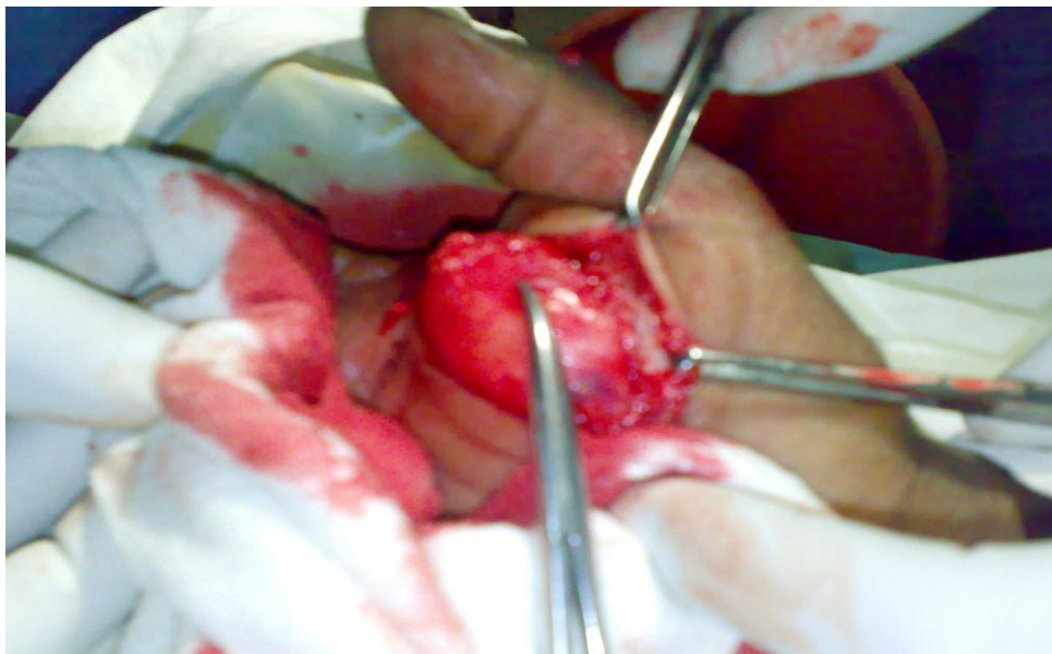
Fig-5. Extraction of Thenar Lipomatous swelling