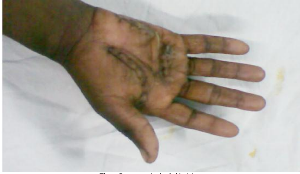
Fig-9. Post operative healed incisions