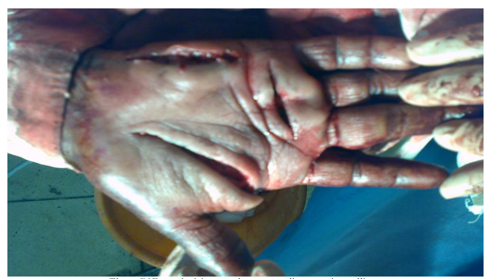
Fig-8. Different incisions used to remove lipomatosis swellings