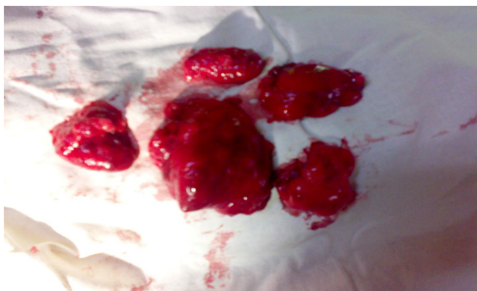
Fig-7. Extracted masses of Lipomatosis