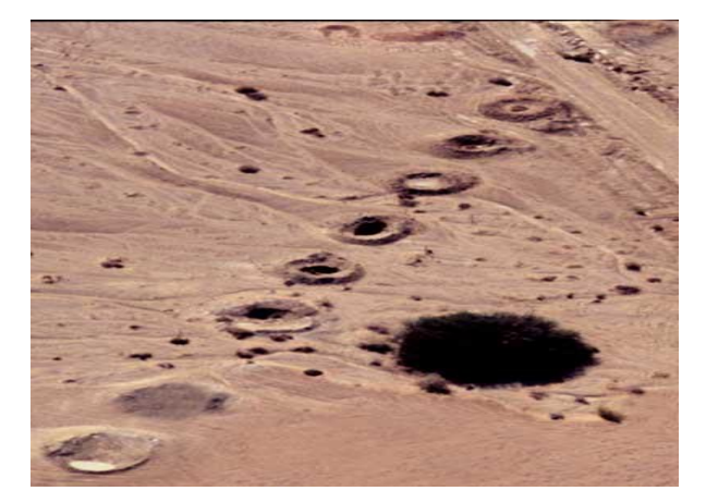
Figure-1. Features and Specifications a qanat.