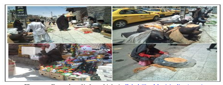
Figure-2. Examples of informal jobs in Zabol City Municipality (2011)

According to the above data, the women peddlers generally sell bread, fruit and vegetable, artistic crafts, handicrafts and clothes.