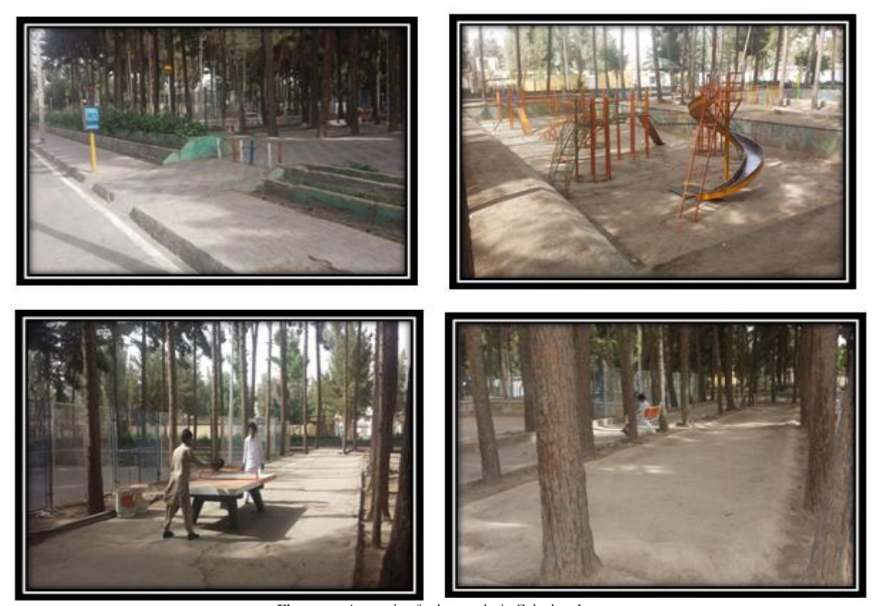
Figure-1. A sample of urban parks in Zahedan, Iran