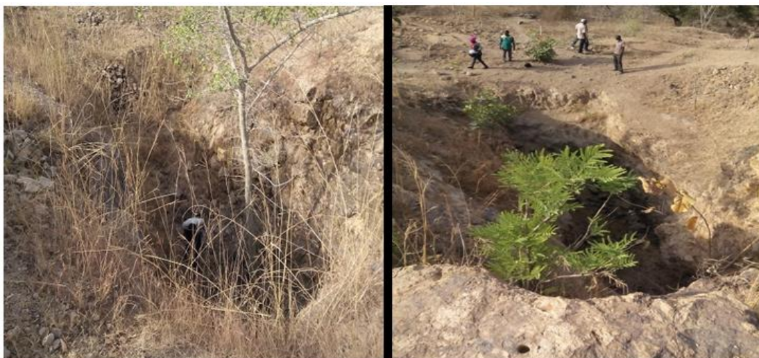
Plates-2a and 2b. Abandoned uranium mine pits at Mika