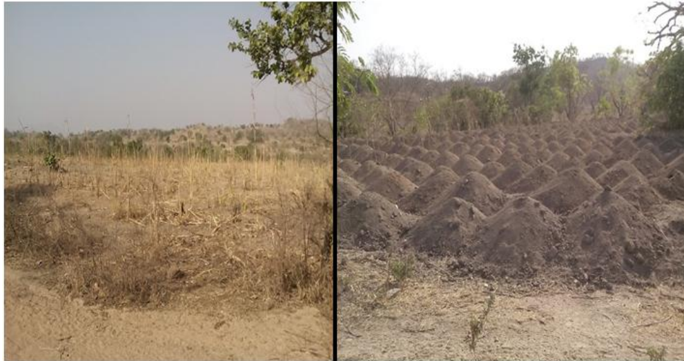
Plate-3a and 3b. Maize and yam cropland around Uranium Mine site