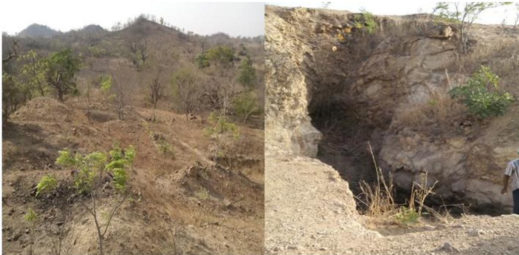
Plate-1a and 1b. Mika Uranium mine site

The uranium mine site is about 3km away from Mika village. The uranium ore is found on hill top (Plate 1a and 1b). The elevation at the foot of the hill is 405masl and hilltop is 425masl. The area of the uranium mining is about 2km 2 allocated specifically by the Federal Government of Nigeria for uranium mining in the locality. There are many uranium open mine pits in the area. However, during the field observation, only 3 abandoned open mine pits (plate 2a and 2b) were seen with the following pit dimensions (Table 1). The mine wastes and overburden were deposited around the mine pits. Most of the overburden materials have been washed away.