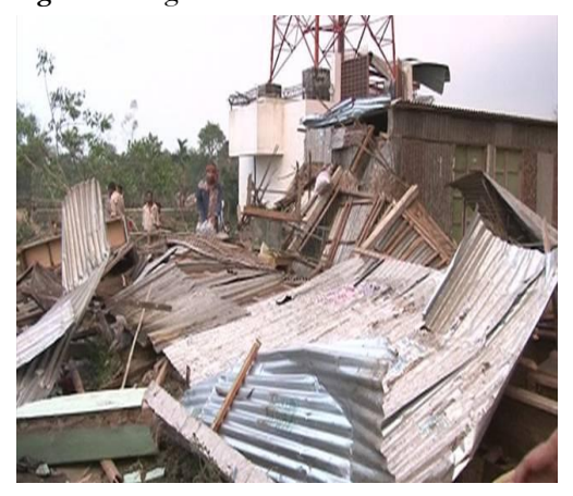
Fig-5. Damaged structures and houses