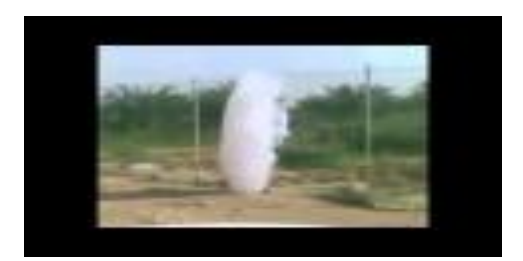
Fig-1. Convection began to grow of tornado