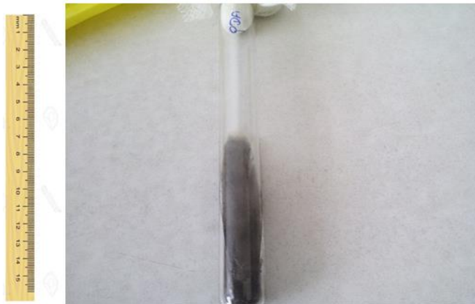
Figure-1. Showing growth of Scedosporium on Sabouraud's dextrose agar.