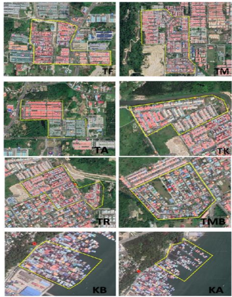
Figure-1. Map of study localities for ovitrap surveillance in Sandakan district, Sabah. Note: *TF-Taman Fajar, TM-Taman Mawar, TA-Taman Airport, TK-Taman Kenari, TR-Taman Rajawali TMB-Taman Merpati Baru, KB-Kampung Bokara, KA-Kampung Air

Eight localities were selected for the implementation of ovitrap surveillance Figure 1. Those localities were selected based on the recorded cases and outbreaks of dengue fever from the year 2011 till 2013 in Sandakan district. The selected localities were Taman Fajar (TF), Taman Mawar (TM), Taman Airport (TA), Taman Kenari (TK), Taman Rajawali (TR), Taman Merpati Baru (TMB), Kampung Bokara (KB) and Kampung Air (KA) Table 1. A total of two hundred ovitraps were placed (indoor and outdoor) at randomly selected houses in each locality. Four ovitraps were allocated at each selected house (two were placed indoor, two were placed outdoor) [11].