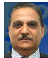
(+ Corresponding author)

3 Email: dr.ibiwani@apu.edu.my Tel: 60193825510