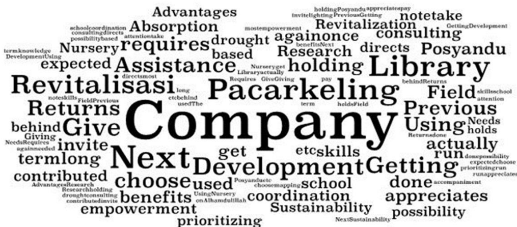
Figure 2. Word frequency query.

In addition to performing the stages of matrix coding queries, researchers also present word frequency queries to identify words that informants frequently use. At this stage, the researcher can calculate the sum and percentage of each word in the source, displaying options for visualizing, coding, and outputting the results of many words with the largest to smallest letters (Woolf & Silver, 2017). The largest word describes that the word is often spoken, and so does the size of the next word. The words that are often spoken by informants are companies, communities, revitalization, libraries, mentoring, the environment, greening, education, development, and others contained in Figure 2.