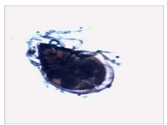
Fig-3. Mites of family Mochlozetidae