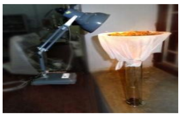
Fig-1. Open Glass Funnel Apparatus