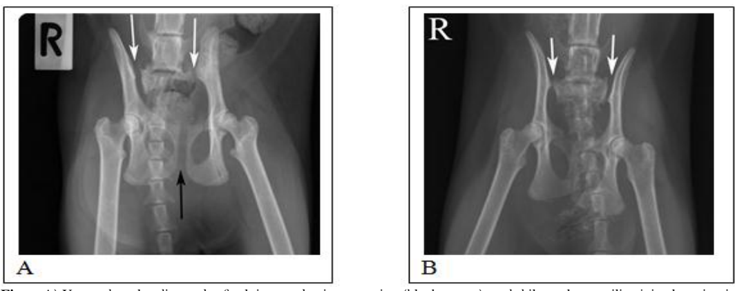
Fig-2. A) Ventrodorsal radiograph of pelvic symphysis separation (black arrow) and bilateral sacro-iliac joint luxation in 6 years male Maine Coon cat. B): Ventrodorsal radiograph of bilateral sacro-iliac joint luxation (white arrow) in 3 years female European short hair cat.