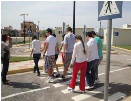
Figure-2. Visiting a traffic education park.

2. Carrying out routes by public bus or by any means of public transportation in the area, in order to make the purchase and validation of tickets, to understand the beginning and end of the route, the various individual stops, the behavior towards the other passengers and finally the use (pressing) of the destination red-stop-button Figure 3.