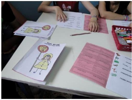
Figure-1. Making of traffic signs from cardboard.