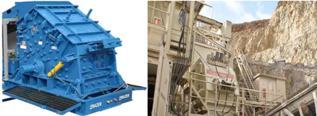
Fig-21. Horizontal Shaft Impactors in operation of breaking rock (Right)

Horizontal Shaft Impactor (HSI) crushers break rock by impacting the rock with hammers that are fixed upon the outer edge of a spinning rotor. These machines are available in stationary, trailer mounted and crawler mounted configurations. They are used in recycling, hard rock and soft materials in wet and dry applications. Earlier it was used on soft materials and non abrasive materials, such as limestone, gypsum etc. They are used as primary and secondary crushers for size reduction. These Crushers offer operators a very high ratio of reduction and can accept larger feed sizes.