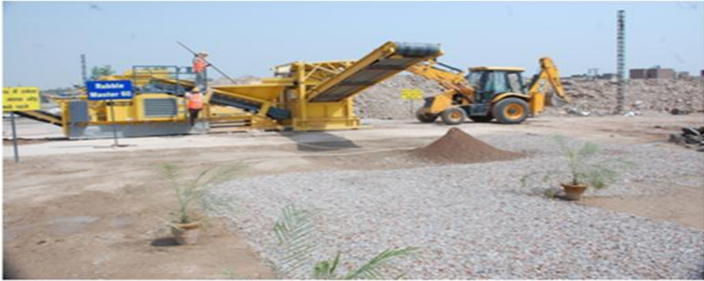
Fig-29. C&D Waste Management Plant setup by IL&FS at Burari, Delhi.

One pilot plant set up IL&FS Environmental Infrastructure and Facilities Ltd. for North Delhi Municipal Corporation is functioning at Burari, Delhi. The plant is built up in about 7 acres (28000 sqm) of land with a capacity to handle about 500 T of C&D waste per day.