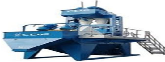
Fig-31. Evowash System

Next stage of screening is sorting of bricks and concrete manually. Before actual processing starts, the bigger sized masonry or concrete wastes are reduced to smaller size in a rock breaker. Then the leftover waste is processed in central processing unit which has mobile crushing units Rubble Master RM 60, with capacity of 60 T per hour machines for further reduction in size. This Processed C&D waste is used for sub base of roads and for making bricks, paver blocks & kerb stones. The process flow of C&D waste recycling at the plant is as under:-