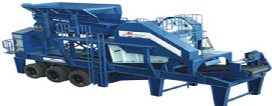
Fig-18. Mobile Jaw Crusher

Mobile jaw crushers are suited for small to medium sized and have hydraulic adjustments for changing the size of finished products. The primary crushing applications ranges from hard and abrasive to mixed recycled materials.