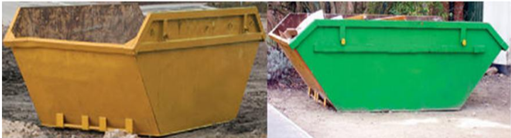
Fig-30. Skips and Containers

There are designated collection points where containers and skips are placed as a first storage point of C&D waste where the waste is brought in by public and private persons. As an additional measure, sufficient vehicles are also in operation to collect the waste from various locations of the city as per the services required from pick up points. After the collection of Construction and Demolition waste, the material is routed through the Weighbridge to the processing site.