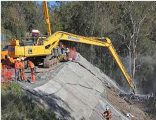
Fig-5. Komatsu PC450 with super long reach boom and drilling rig attachment.