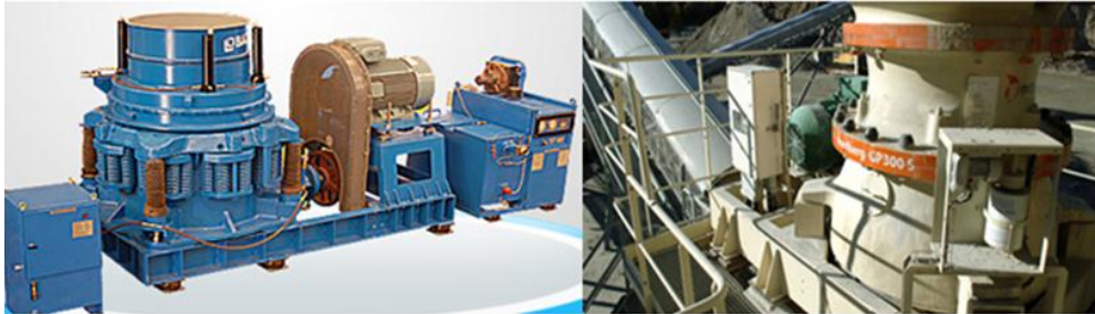
Fig-19. Cone Crushers

A cone crusher is generally used as a secondary crusher in a crushing circuit. Pre-crushed