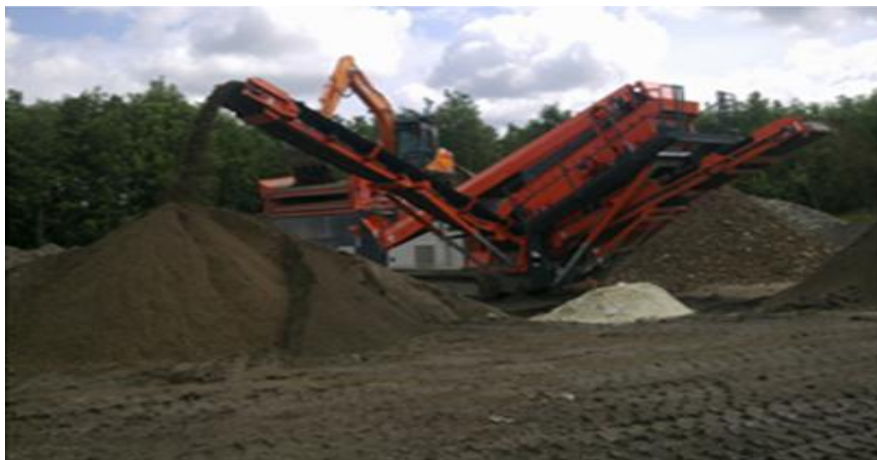
Fig-22. Screening of materials

Screens are equipment that is used for the separation of material into 2 - 6 different sized products. The material is separated by passing it through a vibrating 'screen box' which a number of different sized screens, or meshes, which the material falls through like a sieve.