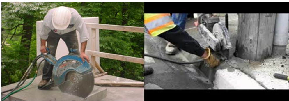
Fig-12. Concrete Cutter in Hand cutting concrete

Very handy equipment but heavy duty designed to quickly break away large, thick pieces of concrete. The benefits are limited dust, support a clear view at the rescue scene, no vibrations and prevent risk of secondary collapse.