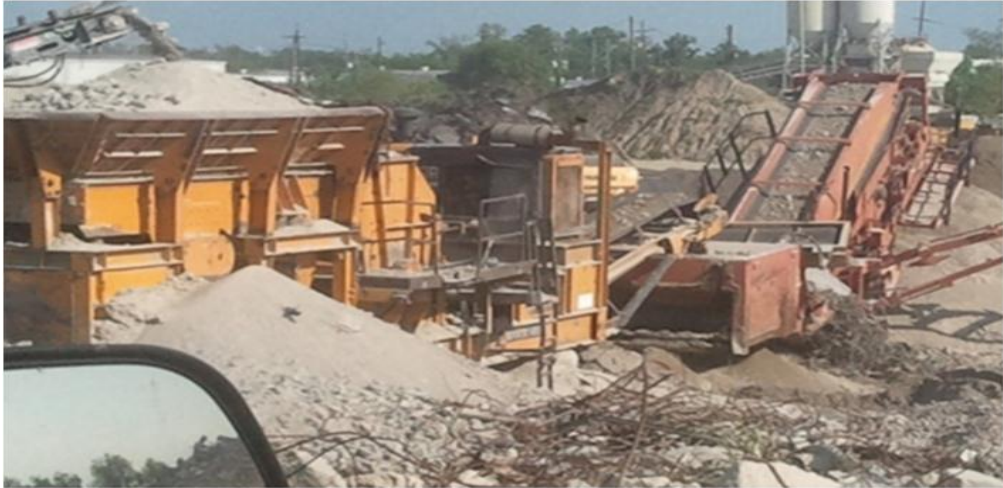
Fig-27. Concrete Recycling Plant

The controlled demolition is done by placing a series of small explosives in strategic locations in the structure and its detonation is so timed that a structure collapses down with the gravity on itself, minimizing any damage to its surroundings. Most commonly used explosives are Nitroglycerin, dynamite to blast reinforced concrete supports in the structure. Explosives are then detonated progressively throughout the structure. This method is also used for demolition of other structures as well other than buildings.