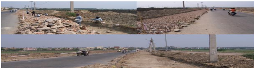
Fig-33. Test Road with C&D Waste