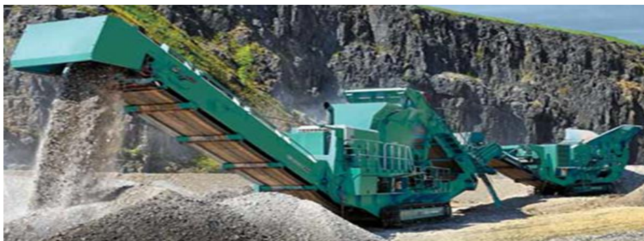
Fig-20. Mobile Cone Crushing Plant in operation

The mobile cone crushing plant works on construction site. The mobile cone crushing plant can be shifted to crushing place directly as it will maneuver both in smooth and bumpy roads. It is compact to use and operations are simple. The mobile crushing plant fitted with generator, motor and control box on the trailer is suitable to work at outdoor with ease. The mobile crushing unit can function independently or can be used as a secondary unit for fine crushing. It can also work as a production line with the screening equipment according to the requirement of customers. Materials are delivered by belt conveyors, which is simple to operate and easy to maintain.