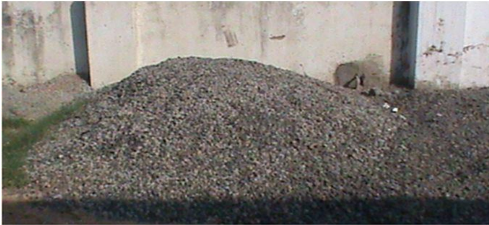
Fig-14. Recycled Coarse Aggregates (RCA) after processing

Sometimes, good sized precast element are also obtained during the demolition, which have a potential of being reused or otherwise, these are also crushed and converted into the recycled aggregates. Limitation is there in use of these recycled aggregates. The production of concrete in India is governed by BIS and IRC codes i.e. IS: 456, IS: 1343 or IRC: 112. All these codes allow the use of naturally occurring aggregates only conforming to IS: 383. To overcome these limitations, it is required to make a special provision of use of Recycled aggregates in combination with naturally occurring aggregates. Thus, use of recycled aggregates can be there with different value of their share by suitable replacing the component of naturally occurring aggregates. It will help out not only in meeting the situation where there is acute shortage of natural resources, but also a steep towards the sustainability. In our bye laws or environmental law, framing of rules will be required for the use of C&D waste. It can have a provision in Environment Protection act, 1986 or a separate act can be introduced independently. Guidelines are required to be framed for use of C&D waste. If we look at other countries like Norway, Japan and Korea, a major junk of demolition waste is recycled and is being used as a partial replacement of natural aggregates and concrete thus produced is being widely used in these countries.