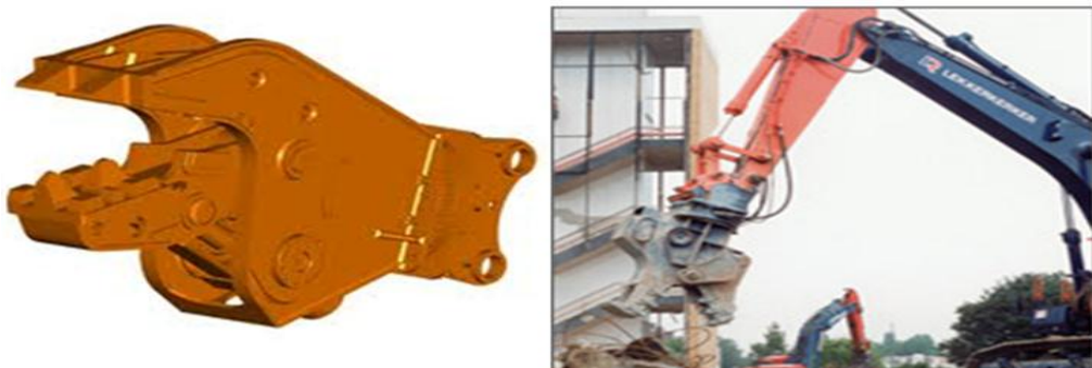
Fig-4. Jaw of Hydraulic Concrete Crusher (left) and VHC -30 in operation (Right)

Hydraulic concrete crusher uses the jaws to crush the structural components to be demolished. The jaw opens and closes under hydraulic control and this action helps in crushing the bigger sized components crushed into pieces. The pair of jaws is detachable and suitable types of jaws like cracking jaws, shear jaws or pulverizing jaws are attached as per the requirement. These crushers are mainly deployed as supplementary measures for finer crushing after carrying out the initial demolition by hammers, crushers, blasting, ball and crane, or sawing.