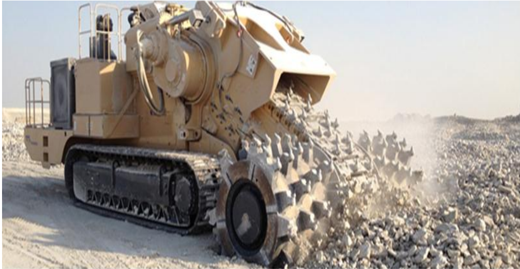
Fig-9. Rotary Drum Cutters in operation cutting concrete Roads

Rotary drum cutters are very versatile and are widely used for trenching hard stone, cutting pile heads and are put into use for construction as well as demolitions works as for cutting it can cut through concrete as well as bituminous road surfaces.