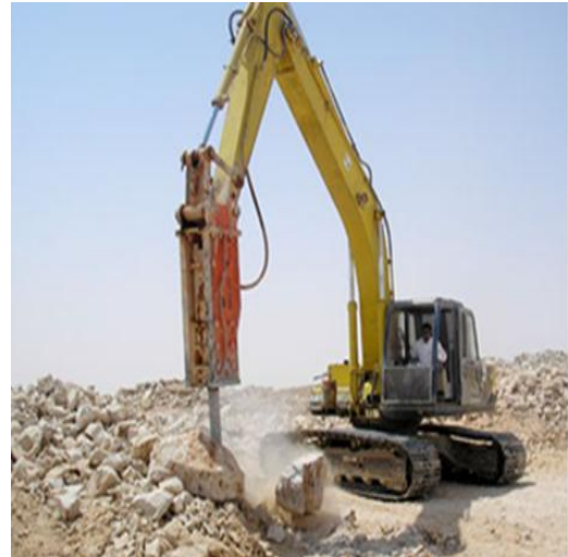
Fig-2. Mounted Hydraulic Breakers