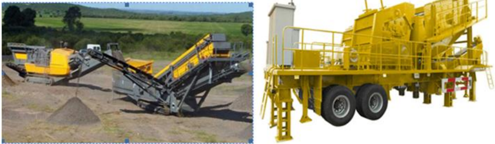
Fig-16. Portable concrete crushers in operation (left) and on mounted on carrier (right)