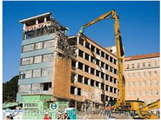
Fig-6. Caterpillar CAT 385 C