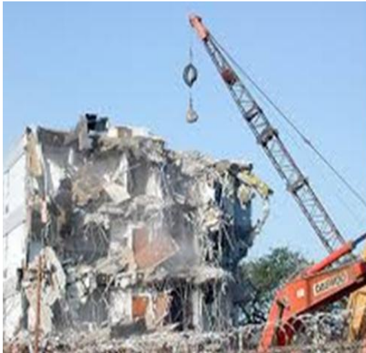
Fig-1. Wrecking Ball: Uncontrolled demolition