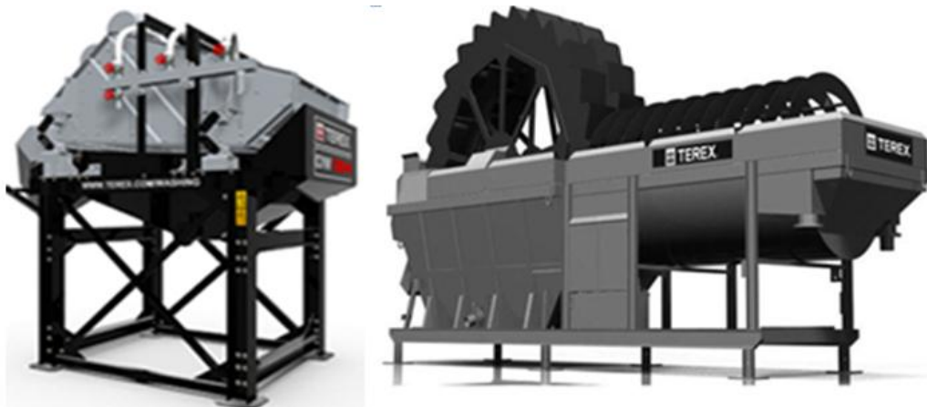
Fig-24. Dewatering Screens

Dewatering Screens are used for de-watering, de-sliming, de-gritting, rinsing, scrubbing and washing. Dewatering Screens offer multiple advantages for construction and specialty aggregates producers including a drier, drip-free product that other types of equipment cannot provide. There are many applications for Dewatering Screens in the aggregates market including dewatering after Sand Classifying Tanks and Fine Material Screw Washers, or use within a system such as the Recipe Sand Plant.