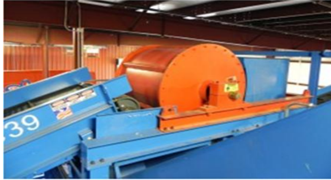
Fig-26. Material Sorting Screen

Screens and magnets may also be employed with the human labor method, but the materials are left in their original form rather than crushed so that they can be easily distinguished and sorted. The most common approach is a blend of the mechanized size reduction and the human sorter methods.