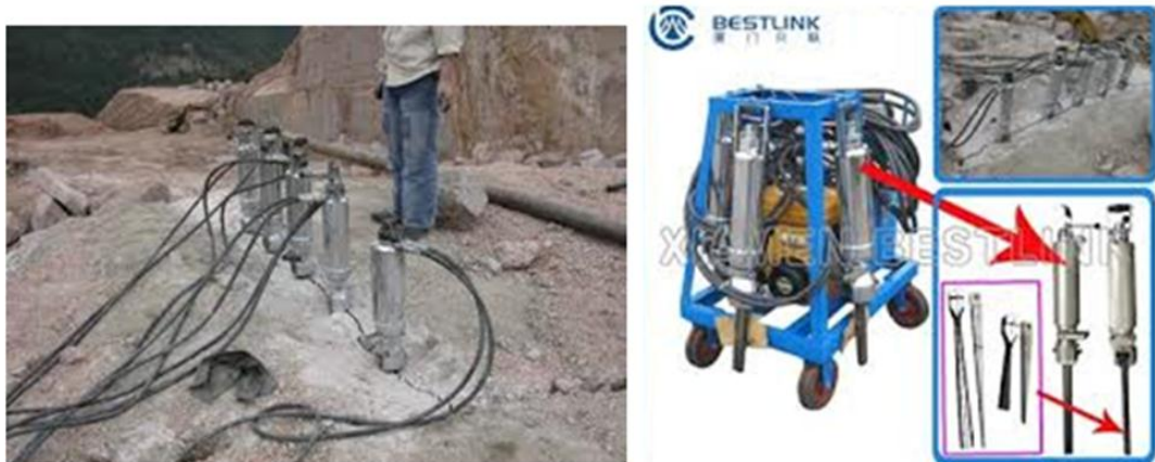
Fig-3. Hydraulic Concrete Splinters used for splitting the hard rock

These machineries are suitable for carry out the demolition RCC walls, concrete roads, deck slabs of bridges, industrial floorings or even splitting the rocks into pieces. For using these machines, initially holes are drilled into the surface at certain distances and the tool is pushed mechanically into the holes which split the structural components into smaller pieces.