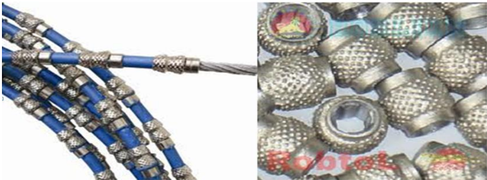
Fig-7. Diamond Wire Saw with Diamond Tools

Diamond wire saws are more efficient than circular saws and can cut concrete of any thickness. The wire is wrapped around the concrete component to be cut into pieces with the help of diamond tools.