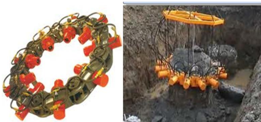
Fig-13. Modular Pile Cutter (left) and cutting Pile Head (Right)

These versatile modular pile cutters enable you to hire the exact pile cutter to suit square or circular piles in the size and diameter of your choice. For square piles 200 – 500 mm and circular piles 200 – 900mm. Cutting piles and preparing ready for foundation work has never been more efficient.