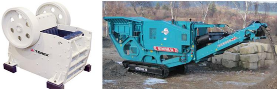
Fig-17. Jaw Crusher in operation (Right)

Jaw Crusher (or Rock crusher) is ideally suited for primary crushing of stones and is often used in mining, metallurgy, building materials, roads, railways.