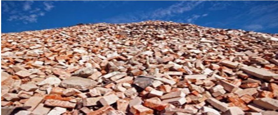
Fig-15. Demolished Brick

reason or different needs other reasons that the building has outlived its useful/economical service life and required to be replaced with new structure. During the demolition process itself, bricks obtained are stacked for next use in its original form after the removal of mortar which is chiseled out and make the brick ready for reuse or recycling, if not reusable.