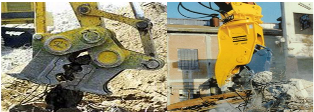
Fig-8. Pulverizers being used for removing boulders