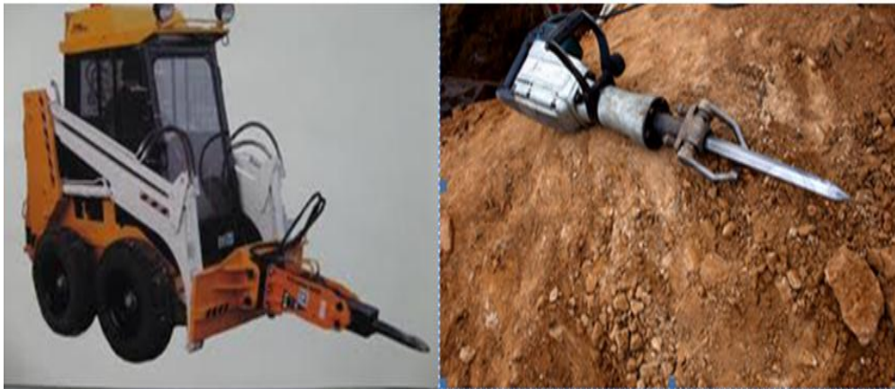
Fig-11. Pneumatic Hammer mounted on carrier (left) and being used for drilling rock (Right)

Pneumatic hammers are mounted on lighter carriers and with the external air compressor are very useful in confined areas for drilling or chipping tough materials such as concrete and asphalt surfaces