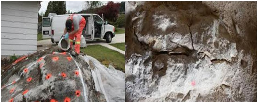
Fig-10. Expansive Demolition Agent being poured in predrilled holes (left) and crack developed and widened thereafter (Right)

The expansive demolition agent is a cementitious powder which is mixed in a bucket and poured into the pre-drilled holes. The mix expands after getting hardened leading to the development of hairline cracks in the concrete slab. These cracks widen further and breaking the