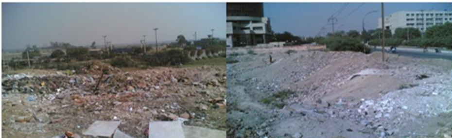
Fig-28. Illegal Dumping of Demolition Waste at various Location in Delhi

About 5000 T of C& D waste is generated in Delhi every day. Out of which 90 % is due to Re-construction activities requiring demolition of existing structures and just 10% is contributed due to new constructions taking place. Out of the total C&D waste, hardly 50 % goes to the landfills, 10 % is recycled and balance 40 % is getting illegally dumped causing all kinds of nuisance, polluting the environment, natural piece of lands and water bodies.