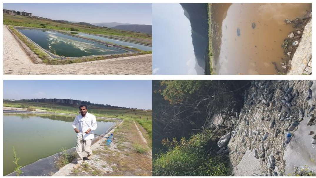
Figure-1. Waste treatment oxidation ponds of Woldia University.