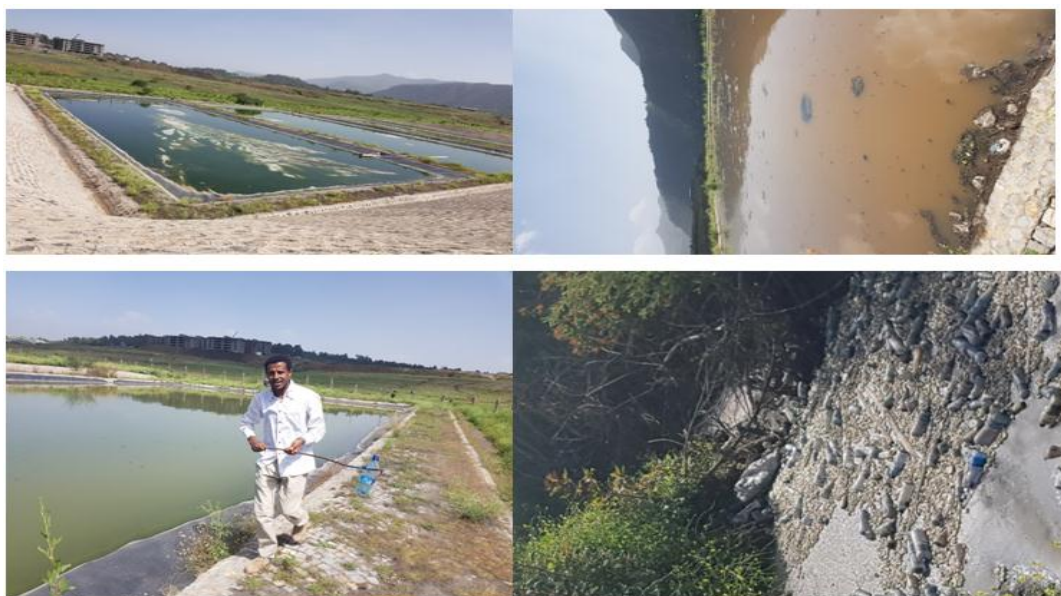
Figure-1. Waste treatment oxidation ponds of Woldia University.