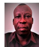
(+ Corresponding author)