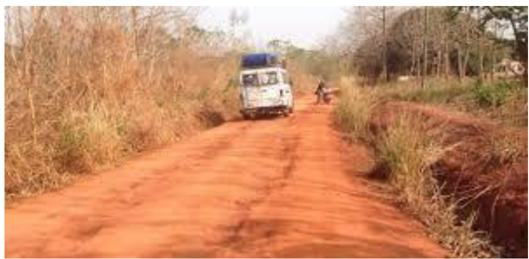
Figure 3. Nature of road at the Boabeng-Fiema monkey sanctuary.

Figure 3 shows the nature of the road leading to the Boabeng-Fiema Monkey Sanctuary. The key informants indicated that because of the poor nature of the road, the transport cost to the sanctuary was very high. This consequently increases the cost tourists had to bear before they could visit the site. This position was reiterated by the District Assembly (Republic of Ghana, 2016). Telecommunication is also an important factor that tourists consider in visiting a tourism destination in this technological era. The key informants and personal observation by the researcher revealed that none of the telecommunication networks in Ghana reaches the sanctuary and the surrounding communities. This, according to the key informants, serves as a disincentive for tourists to patronize their guesthouse at the sanctuary. However, they preferred lodging at Nkoranza and Busunya.