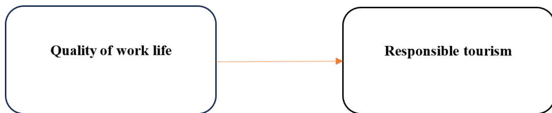
Figure 1. Research model.

Personal information forms, Work-Related Quality of Life Scale (WRQoL), and the Scale of Responsible Tourism (SRT) were used for data collection. Developed by Sirgy et al. (2001) and adapted into Turkish by Bektaş (2015) the WRQoL measures perceptions of the quality of work life on a five-point Likert scale. The SRT, which was developed by Mathew and Sreejesh (2017) and adapted into Turkish by Aylan (2019) measured the perception of responsible tourism using a five-point Likert scale. A software package conducted the statistical analysis, employing both correlation and regression analyses to test the hypotheses established by the research model.