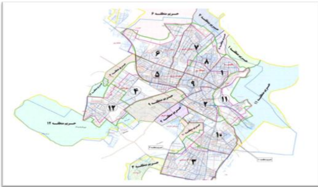
Figure-2. map of Karaj City