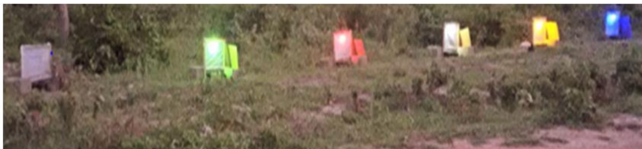
Figure-1. Arrangement of fabricated light traps used for hexapod collections.

Light intensity of each bulb was measured in a dark room using a digital Lux meter (Serial no.: 20111100416). The bulbs were simultaneously powered with tiger generator (TG950) from 1800hr to 2400hr daily. Each trap was serviced the following morning and all trapped hexapods were sorted into their respective orders on the basis of bulb type and colour.