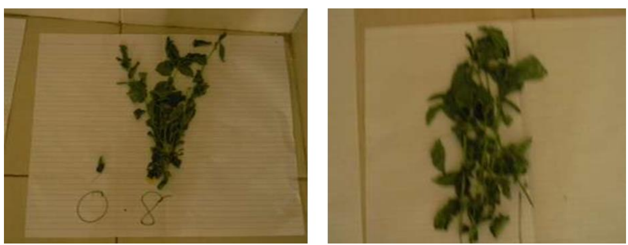
Figure 5. Corchorus olitorius after 24 hours of harvesting.

Figure 5 presents Corchorus olitorius after 24 hours of harvesting.