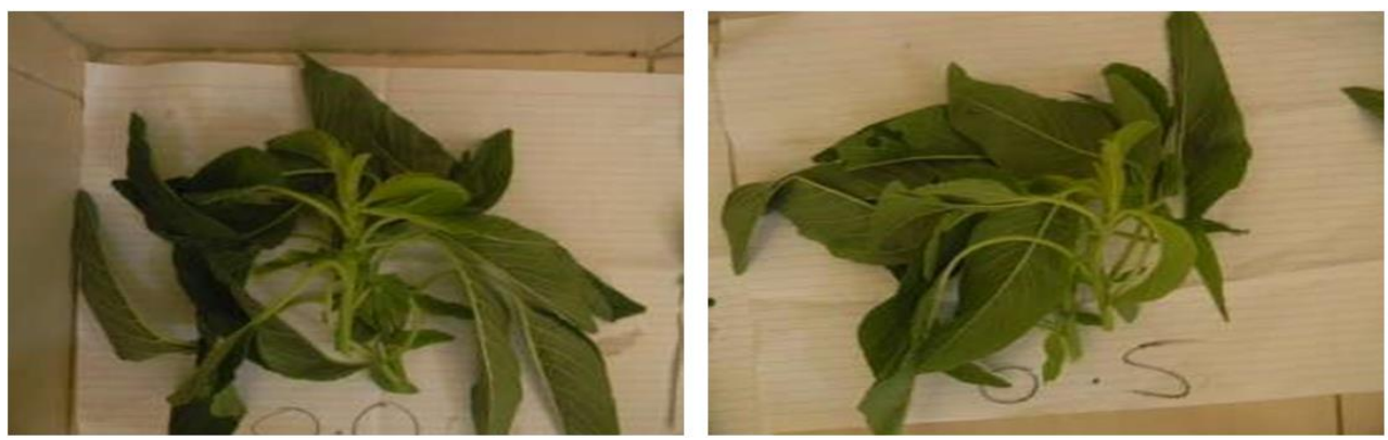
Figure 1. Fresh Amaranthus cruentus.

Figure 2 presents Amaranthus cruentus 24 hours after harvesting.