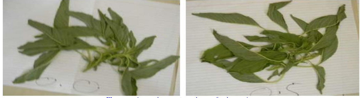
Figure 2. Amaranthus cruentus 24 hours after harvesting.

Figure 2 presents Amaranthus cruentus 24 hours after harvesting.