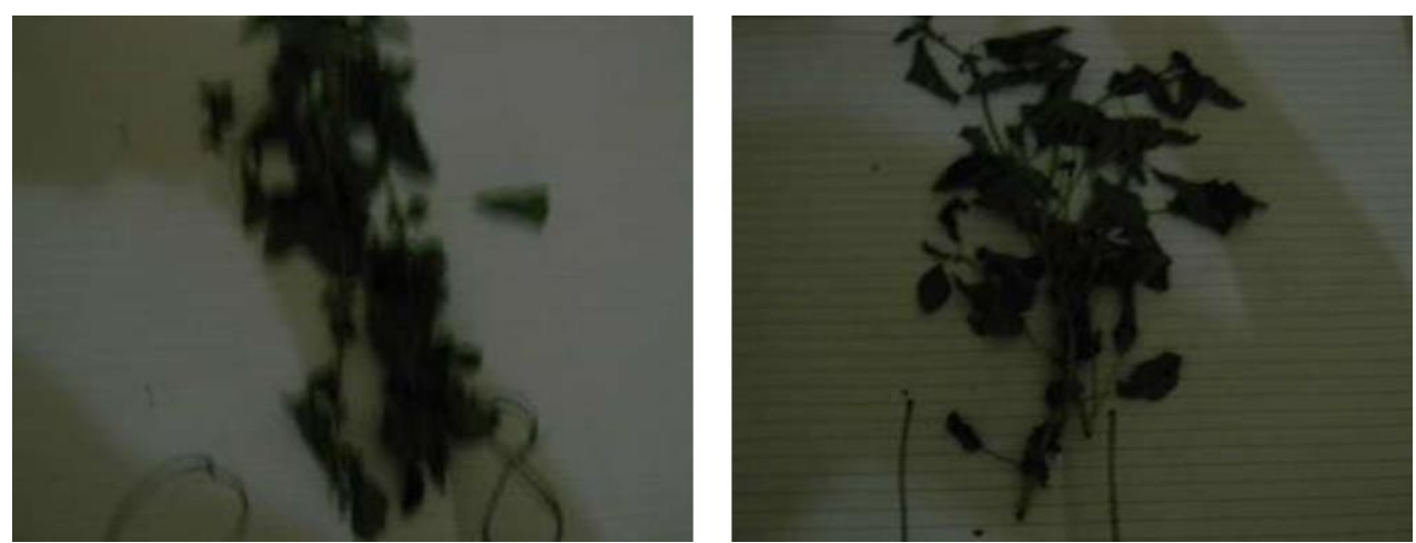
Figure 6. Corchorus Oliterius after 48 hours of harvesting.

Figure 6 presents Corchorus Oliterius after 48 hours of harvesting.