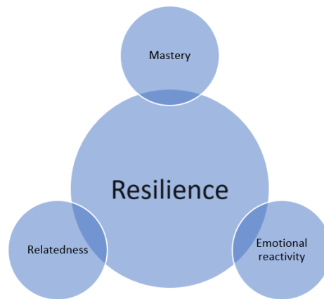
Figure 1. The three-factor model of personal resiliency.

In this model, the three personal resiliency attributes reflect three core developmental constructs: sense of mastery, which focuses on pupils' optimism through positive self-expectations and self-determination; self-efficacy, with significant self-praise and a sense of relatedness, and which reflects a pupil's resilient growth mindset and positive relational ability through enhancing social skills and empathy with tolerance of others; and emotional reactivity, which demonstrates that a pupil's emotional awareness, self-control, and self-regulation, as well as the relationship between these factors, are interrelated (Prince-Embury & Courville, 2008a). This model assumes that a pupil's experience mediates the relationship between external protective factors and positive behavioral outcomes by focusing on psychological processes rather than physical ones (Prince-Embury & Courville, 2008a). Resiliency and a sense of mastery can help develop self-efficacy, which is essential for young pupils and allows them to interact with and enjoy their environment. They develop a competent mindset, and their curiosity leads them to adopt a problem-solving approach, which motivates them to develop a positive attitude and overcome obstacles in their lives, ultimately helping them learn from their own mistakes and avoid repeating them (Prince-Embury & Courville, 2008a).