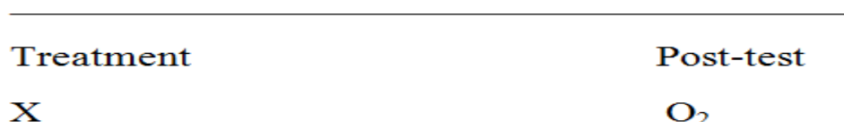
Fig-1. Pre-experimental one-shot case study design

The study use a pre-experimental one-shot case study design (Leedy and Ormod, 2010). Schematic representation of the design is as follows: