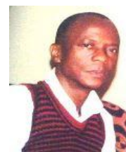
(+ Corresponding author)