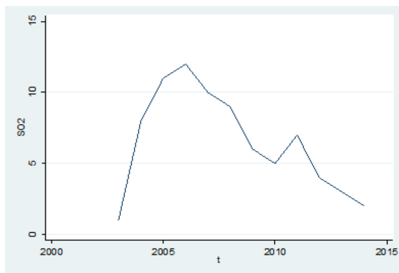
Figure-1. Trend of So2 from 2003-2014 Source: China Statistical Yearbook (n.d.), Researcher