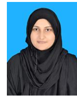
(+ Corresponding author)

5 Email: wanglzzz@sina.cn Tel: 0086 130 8512 1258