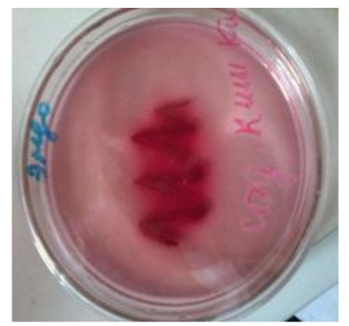
Figure-1. Growth of cultures isolated from the feces of diseased calves on the Endo medium

The data obtained showed that addition of "Lactobacterin-TK2" to the feed provide the optimal microbial balance in the intestine.