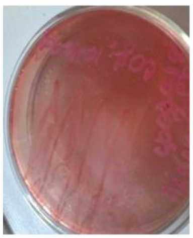
Figure-3. Growth of cultures isolated from the feces of diseased calves on Ploskirev's medium

Moreover, the use of the drug product according to the tested schemes has not materially affected the concentration of hemoglobin and the number of elements and the leukocyte formula in the blood. At the same time the total protein content increased significantly in the blood of the animals treated with the drug product (Table 3).