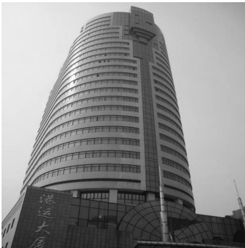
Figure-5. Northern view.