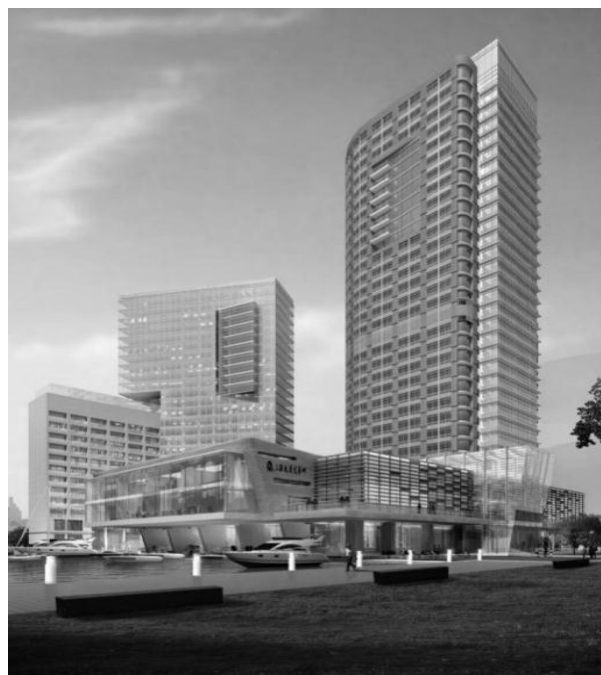
Figure-7. Effect Drawing of SSC after the Transformation.