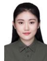
(+ Corresponding author)