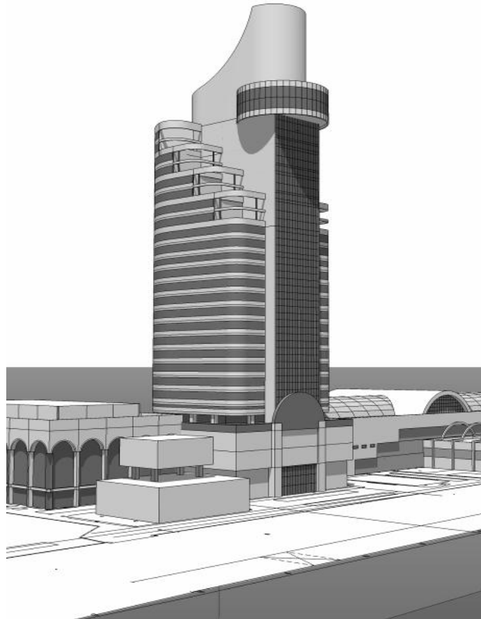
Figure-6. Model Picture of SSC before The Transformation.

perpendicular traffic problem, but also enriches the space of the atrium. Figure 6 and Figure 7 showed a comparison of before and after the transformation.