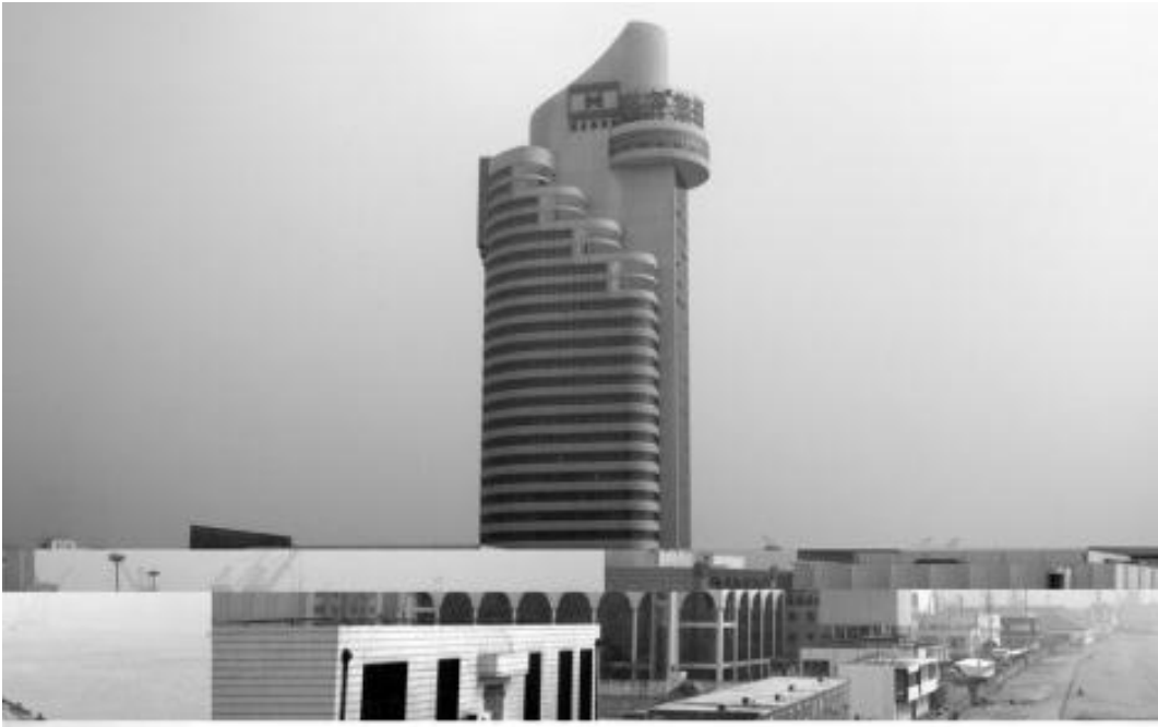
Figure-3. Southern view.