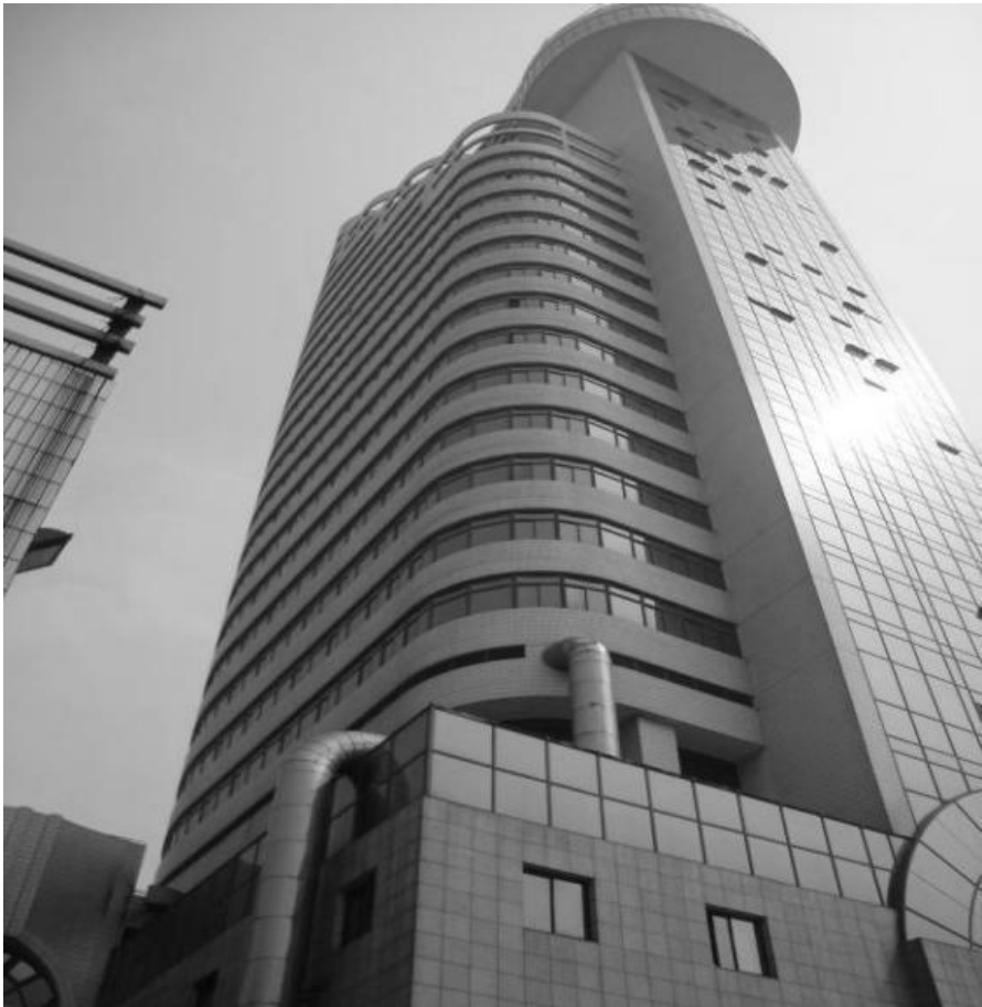
Figure-4. Western view.