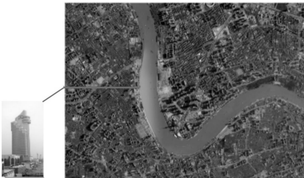
Figure-1. Location of the SSC.

Located in the Golden Triangle area composed of Bund Wanguo complex, Lujiazui financial service area and North Bund, SSC is of great geographical location and plays an important role in the establishment of SSC.