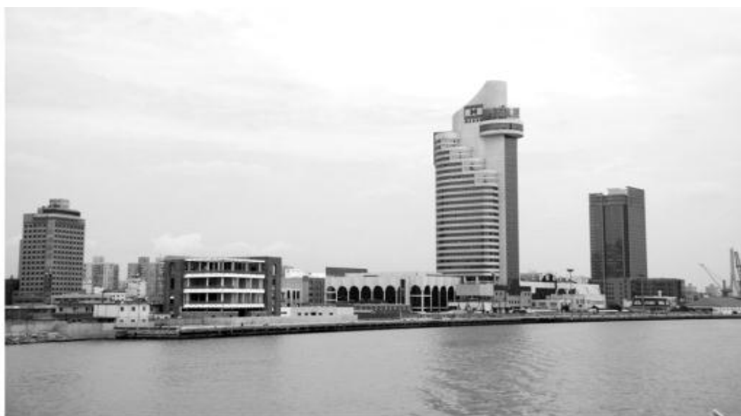
Figure-2. Eastern view.

The original building has been for a long time, the color, shape, interior decoration and building energy-saving standards of which cannot keep up with the current requirements for the construction of an international shipping service center. It is urgent for the building to be rebuilt so that the building can display a good image as a landscape [13]. Figure 2 to Figure 5 showed views from every directions of the old building.