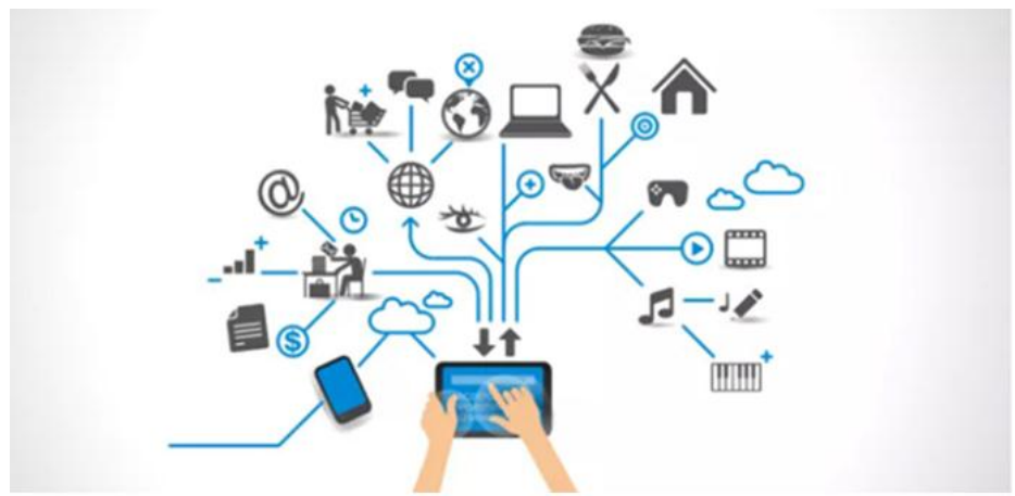
Figure-2. Internet of Things.

To understand how a country is lagging behind, the concept of Industry 4.0 should be reviewed. This includes: