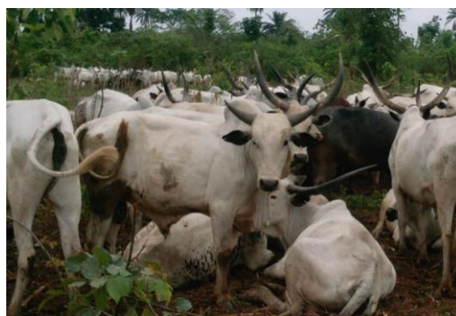
Figure 4. Animals are in physically good body condition.