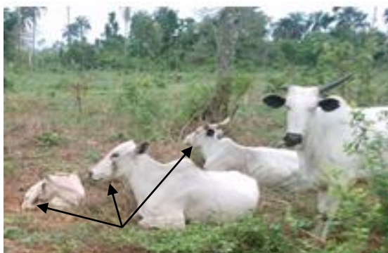
Figure 3. Cows showing lacrimal discharge (Arrows).

The study showed that a good number of respondents, n=73 (85%) has a good knowledge of AAT and symptoms of the disease despite low level of formal education; they seem to be aware of the diseases that affected their livestock. Most herders recognized the highest prevalent diseases as liver flukes 40%, Samore 40%, foot and mouth disease (FMD) 10% and black water disease (cowdriosis) 10%. Almost all the herders correctly described clinical signs and symptoms of AAT to include poor hair coat or raised rough hair, geophagia, lacrimation that appeared more conspicuous and frequently seen than others (Figure 3), loss of weight, loss of appetite, etc. On the contrary, the result showed that majority of respondents 63 (74.1%) of pastoralists do not know the mode of transmission. This outcome could be attributed to lack of formal education. All the herders have good knowledge about the vectors. Some of the respondents claimed that it was indigenous technical knowledge acquired from parents and others said it is based on field experience gathered over the years. On gross clinical examination by physical inspection of animals in most herds (n=10) were in very good body condition (Figure 4). Most cattle belonged to zebu breed ( Bos indicus ) are generally described as trypano susceptible sparse with few Bororo. This might be due to availability of adequate pasture and water that abounds in the area hence, animals undergo less trekking during open grazing.