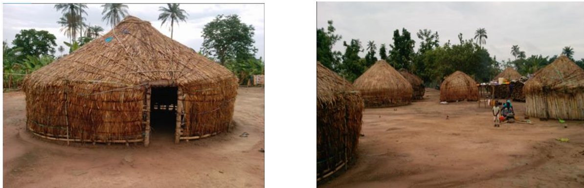
Figure 2. (a & b): A typical Fulani settlement called “Ruga” in Fulfulde. (a) Newly constructed and unoccupied hut. (b) A view of “Ruga” located in Owan East LGA of Edo State.

[32]. All these techniques can be transferred to youths along with other intensive livestock management systems detested by the older nomadic herders. As noted by Sahel Consulting Agriculture and Nutrition Limited [31] practical lessons can be learnt from the smallholder Kenya dairy farmers who are settled, owned 2-5 crossbreeds, which contain up to 95% genetic component of exotic breeds and also engage in crop farming. Whereas the medium to large scale farmers own 5 – 10 or more cows, mostly all exotic breeds, and focused mainly on dairy farming.