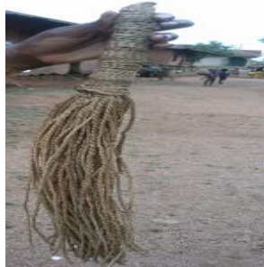
Figure 6. Traditional tsetse fly killer called Agbuza in Owan dialect.