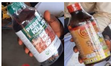
Figure 7. Sample insecticides widely used in the area.