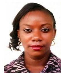
(+ Corresponding author)

1,2,3,4,5 Institute of Agricultural Research and Training, Obafemi Awolowo University, Moor Plantation Ibadan, Nigeria