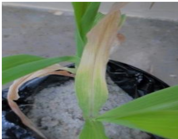
Picture-1. Symptoms of Cd toxicity, the leave were yellowing and wilting.