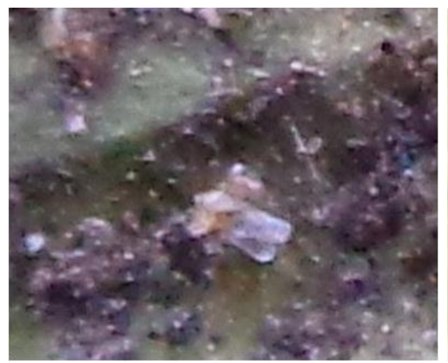
Figure-5. Whitefly adult resembling