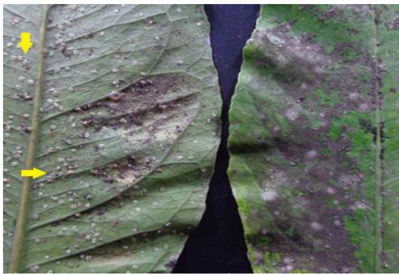
Figure-4. Lemon with an infestation of whitefly on the lower surface