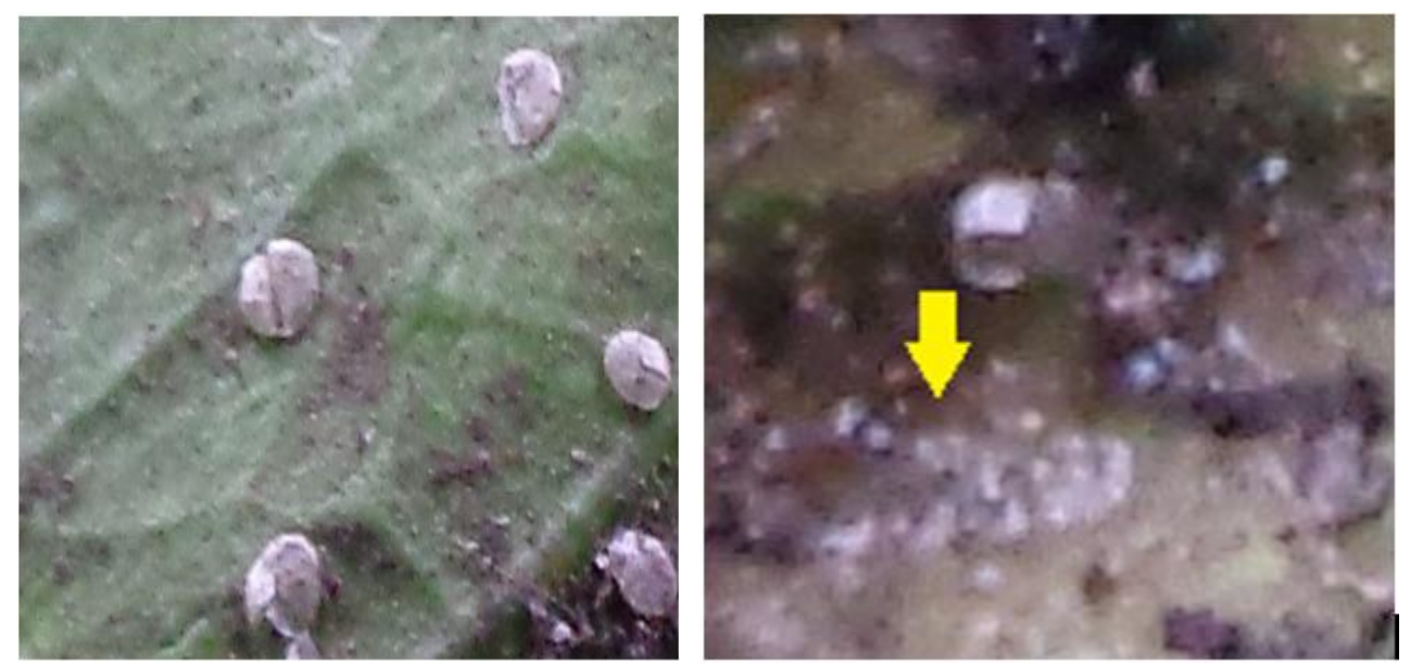
Figure-9. Ecdysis like T shape