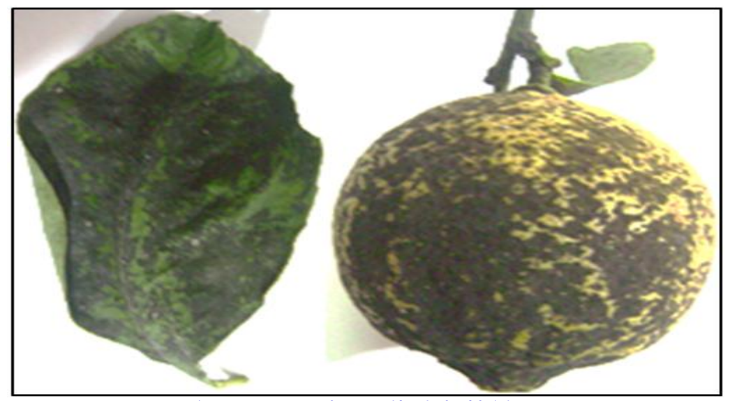
Figure-1. Symptoms of sooty mold on leaf and fruit lemon

The insect specimens were collected and preserved in 70% ethanol and identified based on the morphological characters recorded in [14-16]. Whitefly species identification can be made most easily on the pupal stage. The pupae have species-specific shape, color pattern and wax filament arrangement. Adults can be identified, but identifying species according to pupal stages is more accurate. Under stereomicroscope, Some stage were examined and photographed.