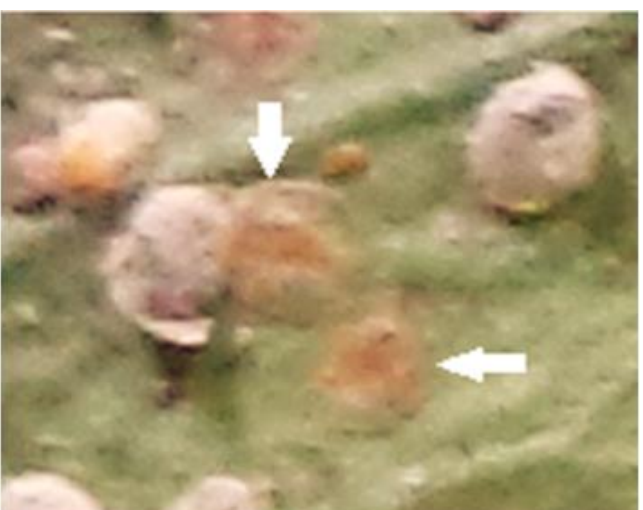
Figure-6. Immature nymphs which a moth resemble scale insects