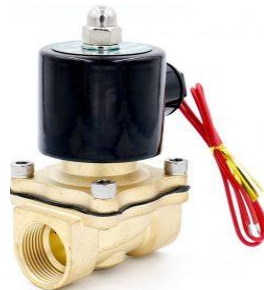
Figure 2. Solenoid valve.

In smart irrigation system, a solenoid valve is designed to be used with a digital timer. Generally, solenoid valves are used for automatic drip systems having arrow of its side that indicates the direction of the flow of water. The solenoid valve is always installed horizontally and downstream side of pump and controlled by electrical power, which is run through the coil. The programmable digital timer sends a signal to the valve telling it to open or close.