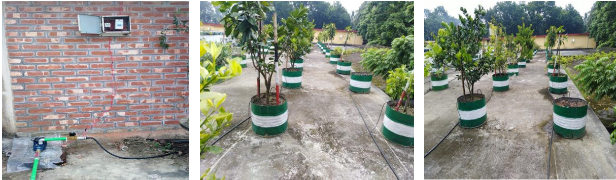
Figure 5. Pictorial view of smart irrigation system for rooftop garden.