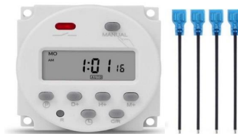
Figure 3. Programmable digitizing timer.

The battery (2A) operated programmable digital timer is used at this system that connects directly to the solenoid valve and electric pump. This timer is manually selector system and simple to program with two dial segments like irrigation frequency 1-2-3-4-6-8-12 hours or 1-2-3 days and irrigation duration 1-3-5-10-15-20-30-60-90-120 minutes. The timer has 4 terminals where 2 terminals for clock (or Power) and 2 terminals for switch. When the rated voltage was connected to clock terminals then clock terminals have power and the switch terminals receive NO power. This simple on-off switch can control any voltage 120V, 240V, 277V, 24V. If connect one hot wire to either switch terminal, and then connect wire going to load to other switch terminal.