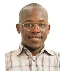
(+ Corresponding author)

6 International Crops Research Institute for Semi-Arid Tropics, Hyderabad, India