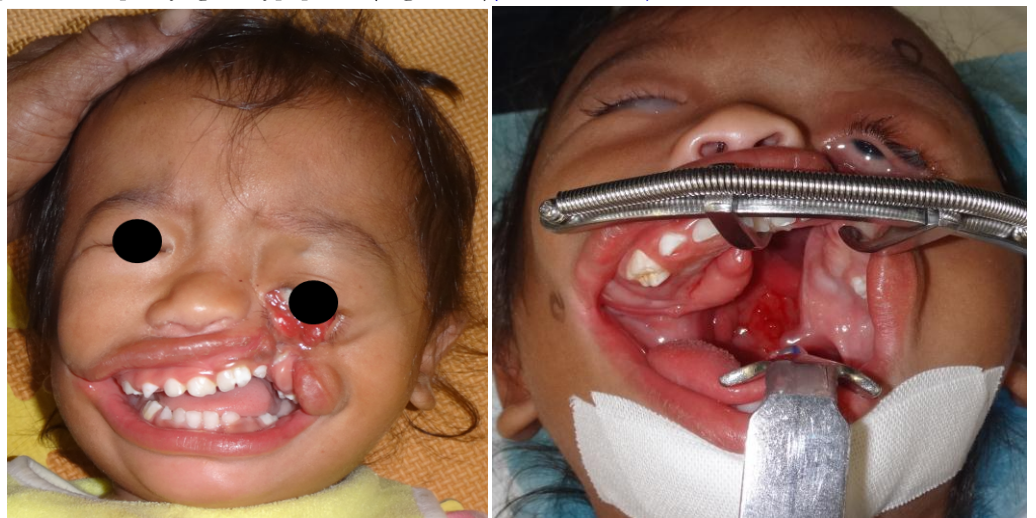
Figures-1. The picture shows the pre-operative appearance of the patient with severe congenital maxillofacial deformity, including a left cleft face, right macrostomia. and a wide cleft palate and pharyngeal hypoplasia.

On the first examination, the patient had a severe congenital maxillofacial deformity, including a left cleft face (Tessier classification No.4; Orbital clefts, cleft lip), right lateral cleft (Tessier classification No.7; Macrostomia), wide cleft palate, and pharyngeal hypoplasia (Figures 1)(Tessier, 1976).