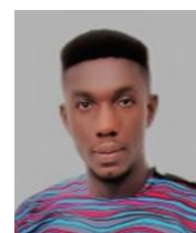
(+ Corresponding author)