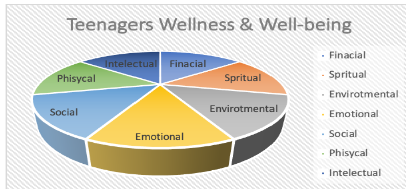
Figure-1. Health and welfare model for adolescents from divorced families.