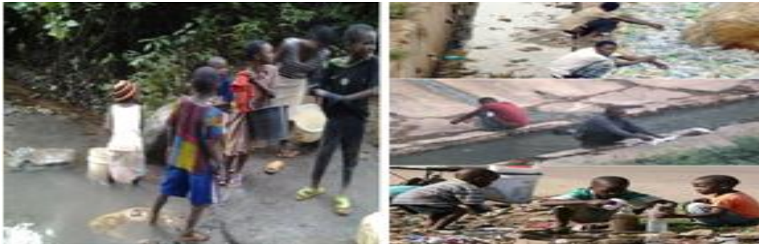
Figure-4. Source of Water Supply in Coal Camp, Enugu and Drainages used as Public Toilet in Kabawa-Lokoja.