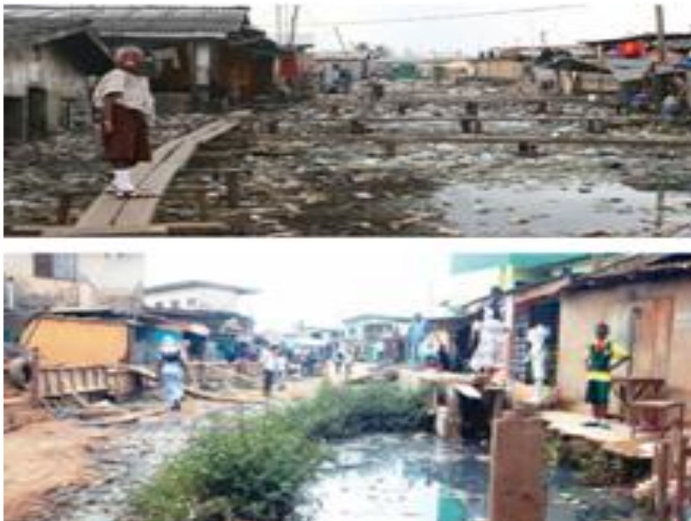
Figure-3. Poor environmental condition of mushin-ajegunle, lagos metropolis.