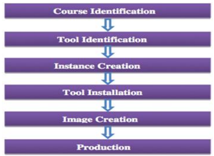
Figure-2. Guidelines in implementing software engineering tools on cloud [1].

In addition, benefits of cloud computing usage are visualized through working on multiple computers and operating systems with regardless of time and location. In addition, universities will have top beneficiaries and this able to optimize the resources more efficiently. To conclude, cloud computing have indulge in many areas weather in education or industry and would have benefited users through quality improvement and providing guidelines in implementing the tools in cloud which also indirectly cause benefit to the society.